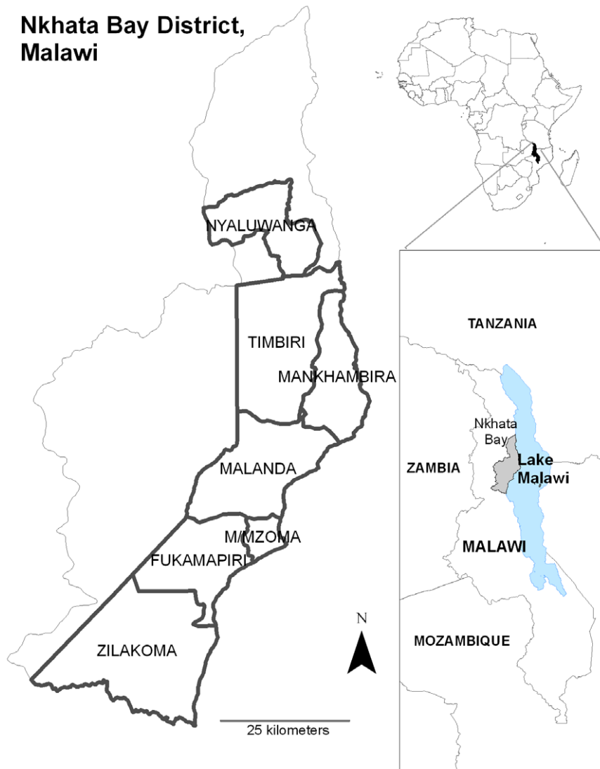
Figure 1. Household interviews were conducted to catalog the consequential lightning strikes in seven Traditional Authorities (TAs) of Nkhata Bay District, fringing the western shore of Lake Malawi. TA boundaries correspond to the period of 2008; Mankhambira TA shown here overlaps the urban TA of Mkumbira (not pictured), which comprises Nkhata Bay Town but was not surveyed. During sampling, Fukamalaza was combined with Malanda TA. doi:10.1371/journal.pone.0029281.g001

on the northwest shore protrudes into the lake and appears prone to disproportionate CLS from storms over the lake.