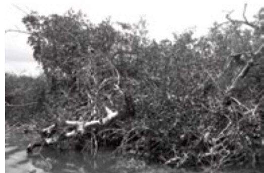
Mangroves, Ria Lagartos Biosphere Reserve, Mexico