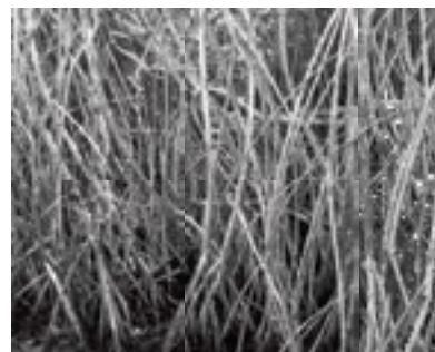
Mangroves, Quintana Roo, Mexico

139. The conservation of existing primary forests where there is currently little deforestation or forest degradation occurring, provides important opportunities for both protecting carbon stocks and preventing future greenhouse emissions, as well as for conserving biodiversity. Most of the biomass carbon in a primary forest is stored in older trees or the soil. 198 Land-use activities that involve clearing and logging reduce the standing stock of biomass carbon, cause collateral losses from soil, litter and deadwood and have also been shown to reduce biodiversity and thus ecosystem resilience. 199 This creates a carbon debt which can take decades to centuries to recover, depending on initial conditions and the intensity of land use. 200 Conserving forests threatened by deforestation and forest degradation and thus avoiding potential future emissions from land use change is therefore an important climate change mitigation opportunity for some countries. 201 Avoiding potential future emissions from existing carbon stocks in forests, especially primary forests, can be achieved through a range of means 202 including: