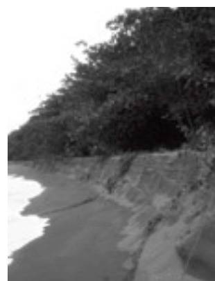
Coastal erosion, Costa Rica