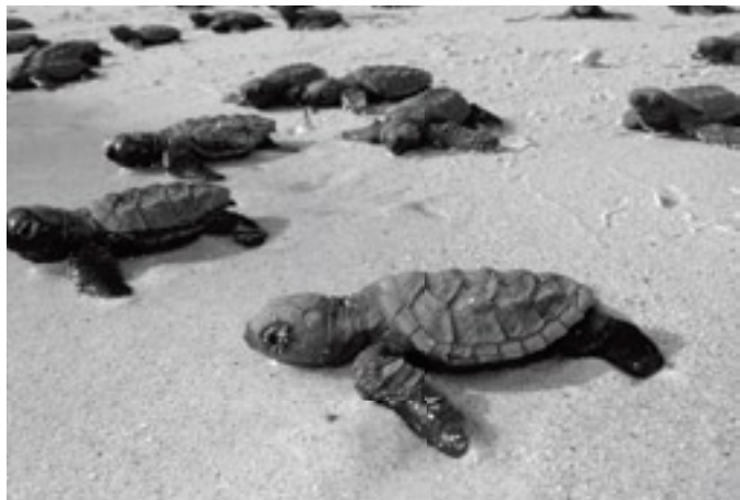
Hawksbill turtles, Nicaragua, Photo courtesy of Sonia Gautreau

18. Further climate change will have increasingly significant direct impacts on biodiversity. Increased rates of species extinctions are likely 26 , with negative consequences for the services that these species and ecosystems provide. Poleward and elevational shifts, as well as range contractions and fragmentation, are expected to accelerate in the future. Contractions and fragmentation will be particularly severe for species with limited dispersal abilities, slower life history traits, and range restricted species such as polar and alpine species 27 and species restricted to riverine 28 and freshwater habitats 29 . Local extinction of species often occurs with a substantial delay following habitat loss or degradation. Accumulating evidence suggests that such extinction debts pose a significant but often unrecognized challenge for biodiversity conservation across a wide range of taxa and ecosystems 30 . Shifts in distributions of native species as an adaptive response to climate change will challenge current wildlife and conservation management practices and approaches.