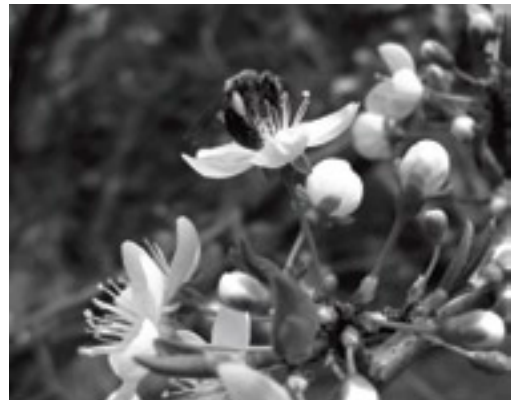
Bee and plum blossom, Canada

118. Climate change increases the risk of reductions in crop and livestock yields. Within a given region, different crops and livestock are subject to different degrees of impacts from current and projected climate change. 141 In light of this, the adoption of specific crops, livestock or varieties in areas and farms where they were not previously grown are among the adaptation options available to farmers. 142 Further, the use of currently under-utilized crops and livestock can help to maintain diverse and more stable agroecosystems. 143 Conserving crop and livestock diversity in many cases helps maintain local knowledge concerning management and use.