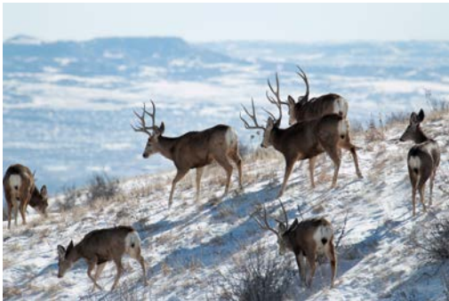
Mule deer herd

Chronic wasting disease (CWD) is a contagious and fatal neurological disease found in deer, elk, and moose. It is caused by the transmission of an abnormal protein called a prion. CWD is relatively widespread in Colorado.