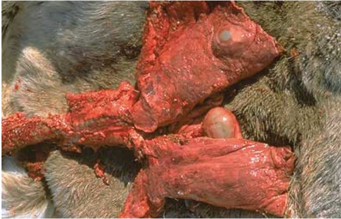
Tapeworm cysts in moose lung.

Definitive hosts support adult tapeworms. Domestic dogs and wild canines (e.g., coyotes, foxes, and wolves) are definitive hosts. Intermediate hosts support the immature (cyst) form of the tapeworm. Several species can be intermediate hosts, including small mammals (e.g., rodents) and ungulates (hoofed animals), including both wild ungulates (e.g., deer, elk, moose) and domestic livestock (e.g., sheep, pigs etc.). 8,9