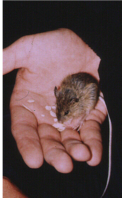
Zapus hudsonius preblei

Although the meadow jumping mouse ( Z. hudsonius ) is common and widespread across North America, the Preble's meadow jumping mouse subspecies ( Z. h. preblei ) currently occurs only in a few watersheds along Colorado's Front Range and in southeastern Wyoming. The historic abundance of PMJM is unclear. However, trapping surveys indicate that a number of historic PMJM sites are apparently no longer occupied. These sites have been disturbed and/or isolated as a result of changing land use (Ryon 1996). Evidence also suggests that the Denver metropolitan area has formed a barrier between the northern and southern extents of the PMJM range (Shenk 1998). In Colorado, PMJM is currently documented from seven counties (Weld, Larimer, Boulder, Jefferson, Douglas, Elbert, and El Paso). The largest and most stable populations documented across the range of the sub-species occur in East and West Plum Creeks in Douglas County, and in Monument Creek on the USAFA in El Paso County.